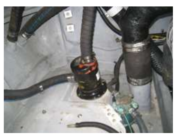
The photos on this page indicate an extremely well cared for and clean bilge, engine room, fuel, and waste tank, exhaust system components and overboard systems.