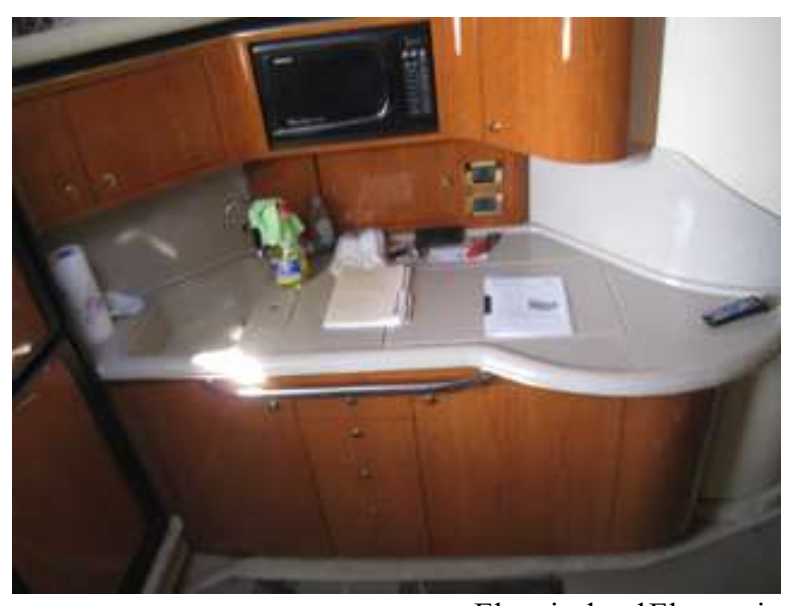
Electrical and Electronics

The electrical panels (main and breaker) are in good shape. There are two 2 position battery disconnect switches beneath the aft deck near the properly installed fuel shut-off valves. The marine type batteries on board (fairly new) are secure. All of the battery terminals are in good condition and free from corrosion. Two 120 volt 30 amp shore power cables are in use. The cables are in good condition. There is a complete bonding system installed, along with a factory installed electrical isolation system. The running lights conform to the CFR. Electronics include a working Raytheon VHF Transceiver, and Depth finder, Radar and Raystar GPS with chart plotter. The electronics was checked out, and all was working properly. A ground fault interrupter is installed. All DC circuits were checked out including the windlass. The water heater (appears to be a recent upgrade) was checked out. The Kenyon AC electric stove checked out OK. The dual voltage refrigerator, is also a recent addition. The cockpit ice maker is functioning. The Mariner battery charger (recent installation) was checked out and in working order. The Cruise Air unites appear lightly used. The electrical control panels appear to be in lightly used condition. The primary DC control panel is mounted on the engine room firewall and appears to be original. (Photo on Page 6)