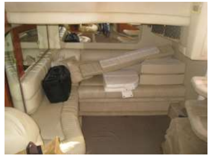
Page 3 of 10