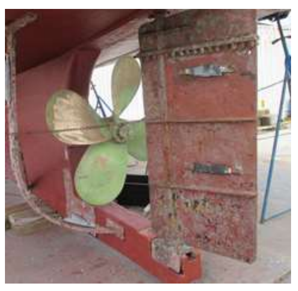
Rudder and propeller