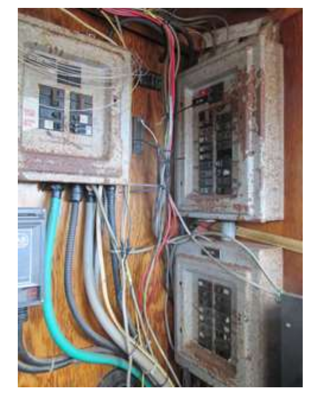
AC panels needing service