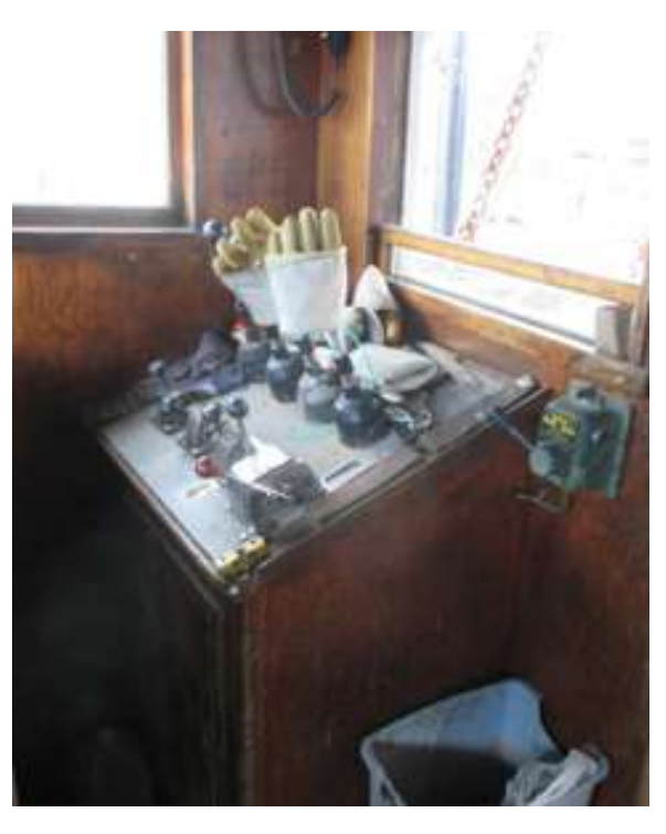
Secondary work operating ststion