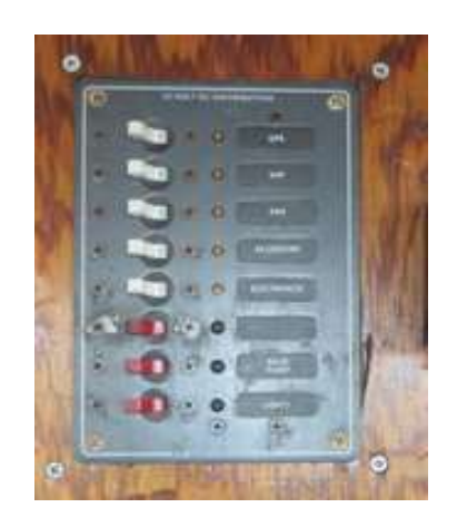
DC\ control\ panel "LONG LINE"