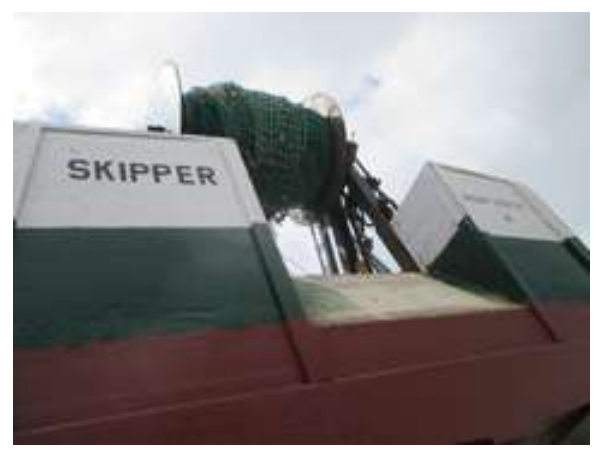
View of transom