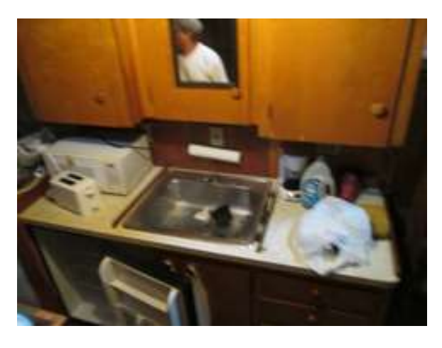
Crews quarters and Galley

The crews quarters and galley occupy the focsle, as usual. The area is spartan, but clean and structurally sound. There are berths for four and a fully equipped galley additional photo on Page 4.